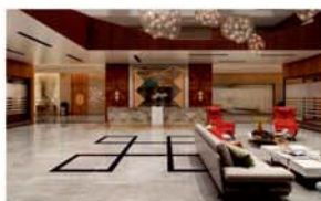
lounge activity 47,000 sft