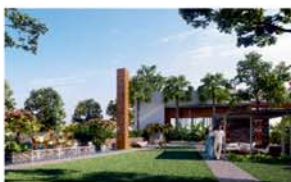
outdoor activity ground