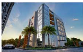
club activity 40,000 sft