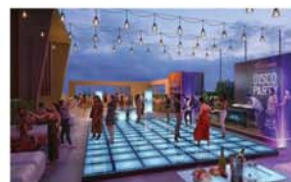
sky activity terrace 40,000 sft